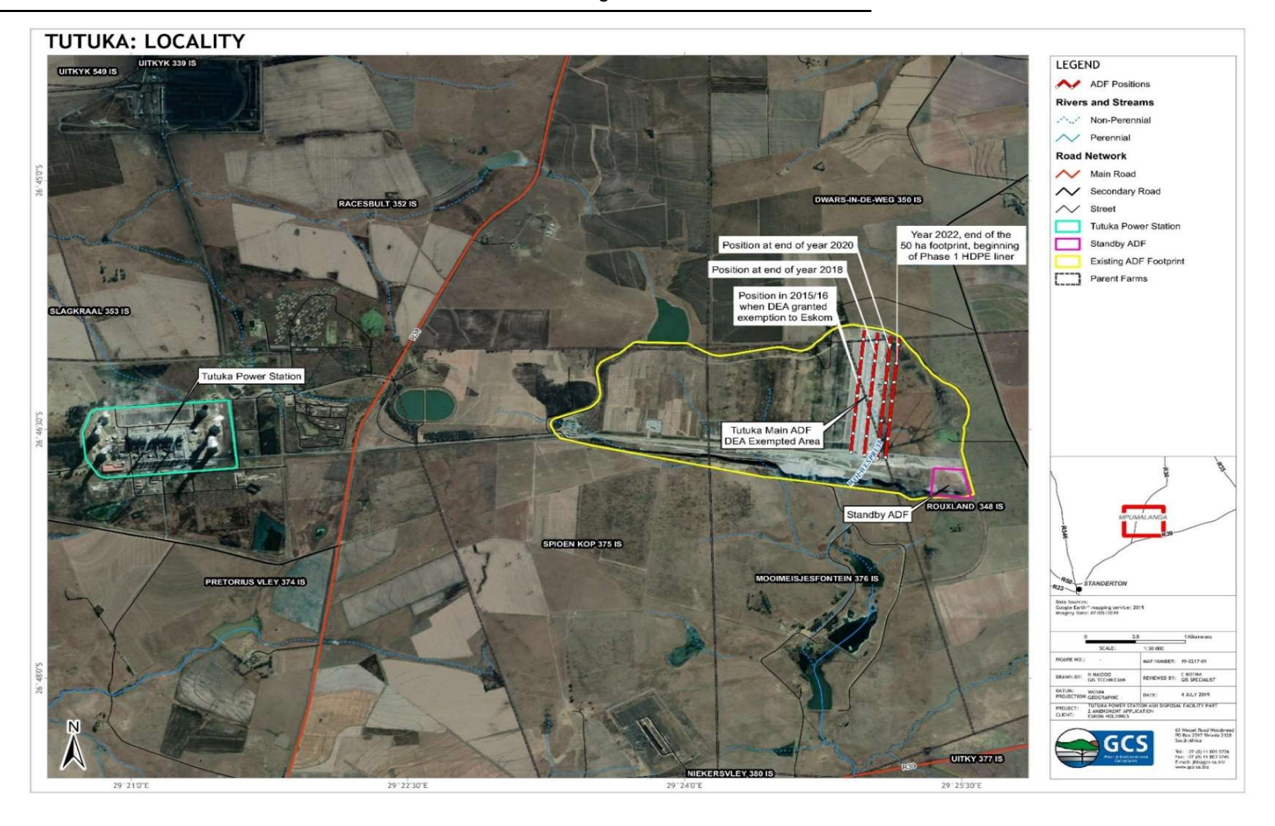
Figure 1: Tutuka Updated Layout Plan